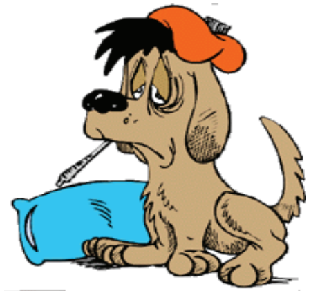
Feeling Under the Weather